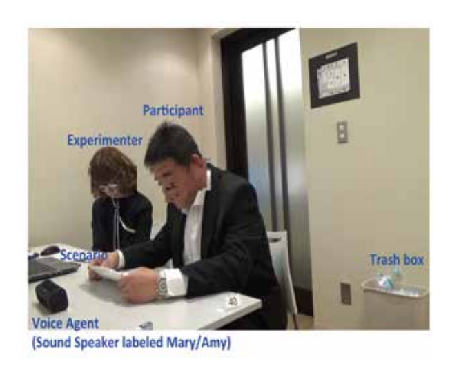
Fig. 2 Photograph of a scene of the experiment